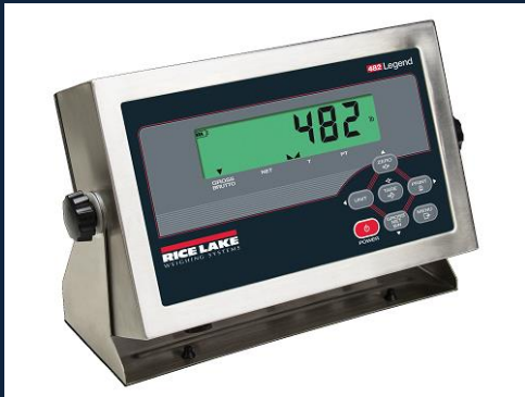
482 LED Display