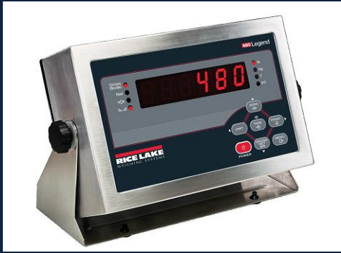
480 LED Display