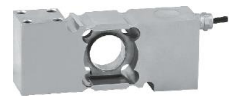
FIGURE S795 - 3