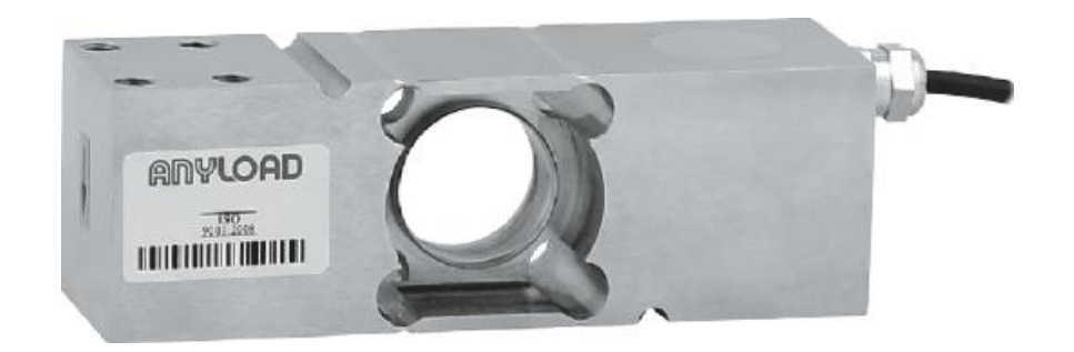
FIGURE S795 - 5