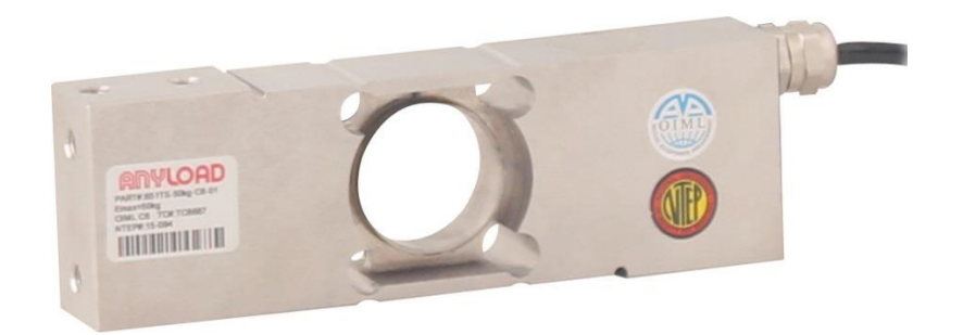
FIGURE S795 - 7