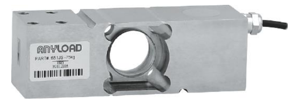
FIGURE S795 - 2