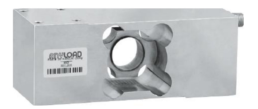
FIGURE S795 - 6